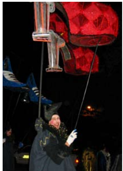
Flying High Heels. Original design commission from Goddesses Incorporated for annual "Muses" parade in New Orleans. Shoes walk on air. Illuminated by electroluminescent wire. Six pair made.