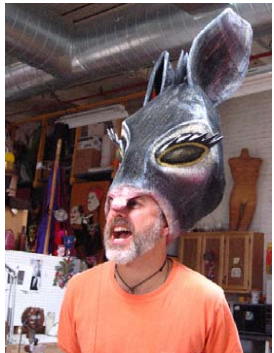
“Bottom” from Midsummer Night’s Dream . Built for New England Shakespeare Ensemble. Ears animated with pull cord. Client wanted less cumbersome design than classic asses head. Hence, a merging with actors own mouth and jaw line.