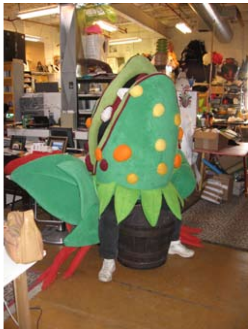
Little Shop of Horrors "Seymour" built for Central New York Costumes for regional rental. Included all four stages of plant.