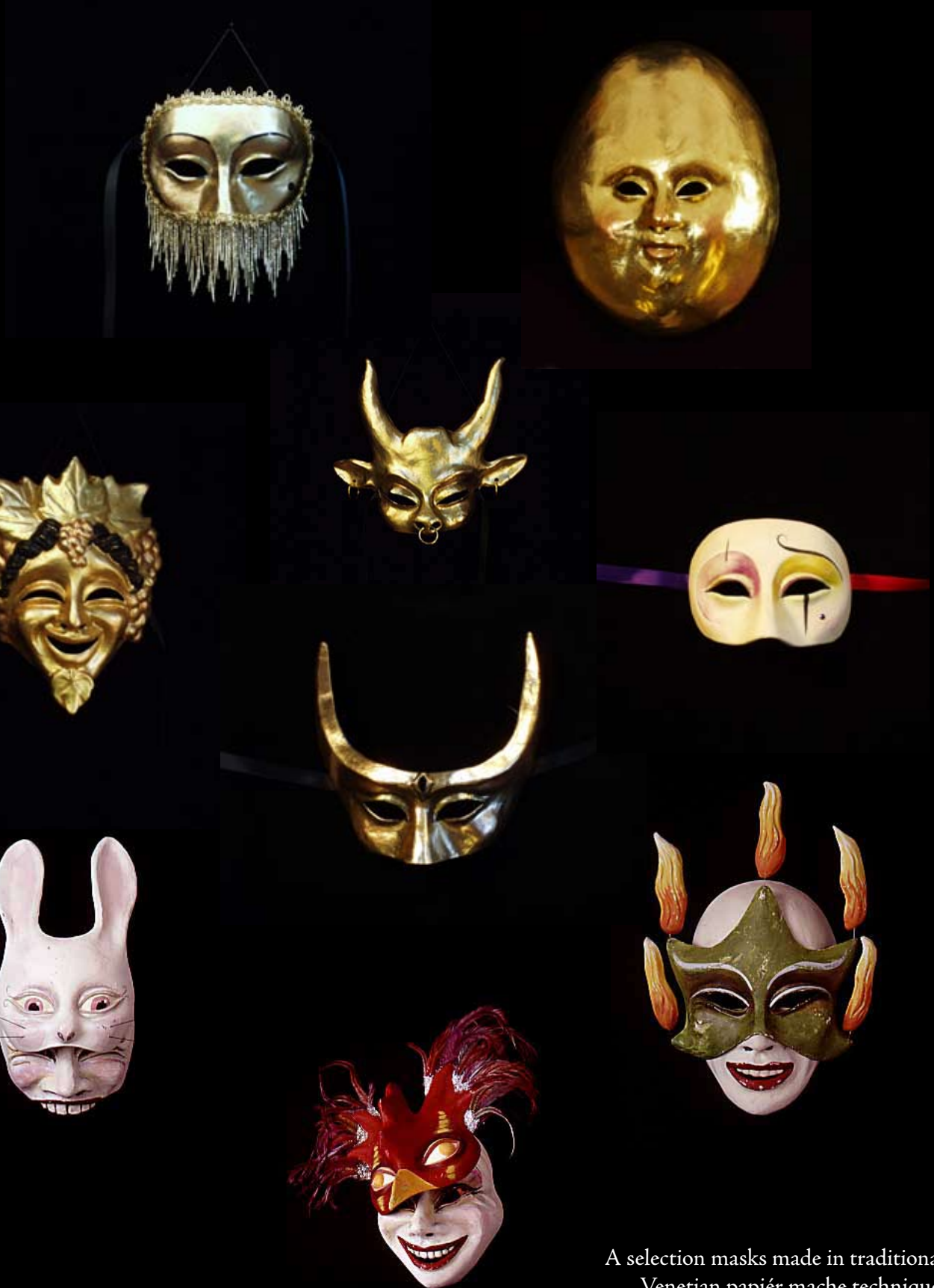
A selection masks made in traditional Venetian papier mache technique.

Commissioned Work, Puppetry Costumes and Masks