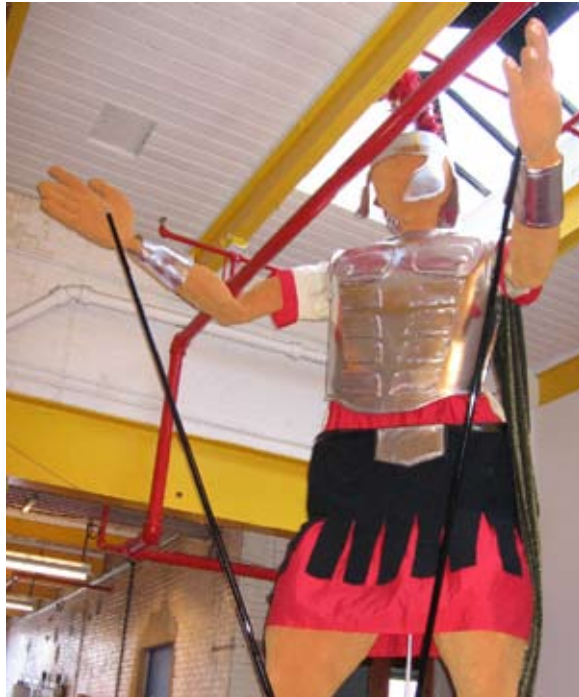
Roman Centurion. 15' giant rod puppets built for UniverSoul Circus.