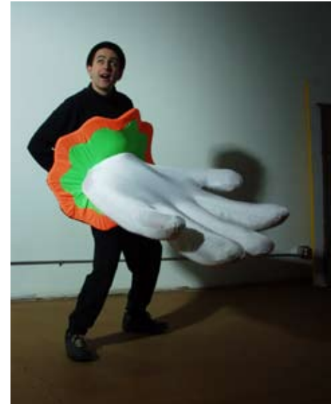
Giant Clown. Built for The Flaming Idiots, juggling troupe. Black light fabrics. Body parts arrange on 3 performers who juggle bean bag chairs between them.